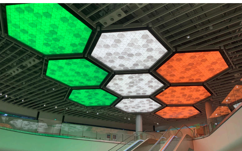
Manchester Airport