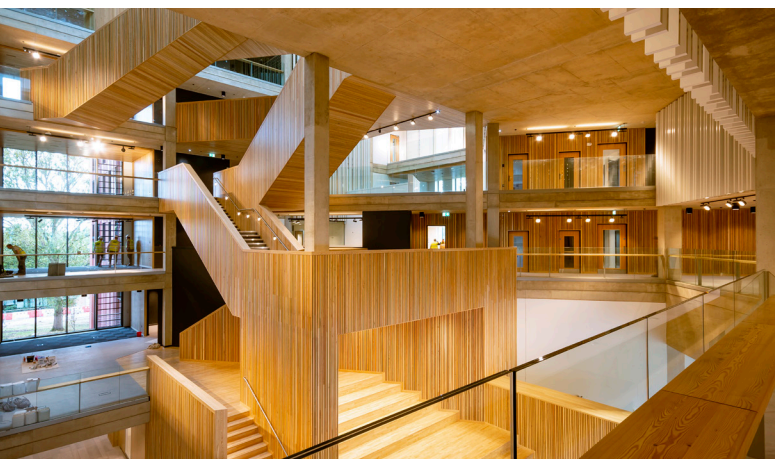
University of Warwick

At Manchester Airport , the main objective of the DALI-based lighting control system is to reduce energy usage. The specification for the project required open protocol technologies in order to future-proof the building. DALI offers a standardised approach across all the airport areas. One interesting feature was the ability to adjust light levels according to the airport's flight data system – light setpoints are increased if a flight is due at a gate, either for arrival or departure, and reduced when no flights are happening.